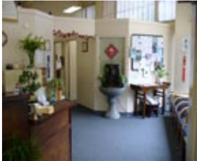
Reception and Waiting Room