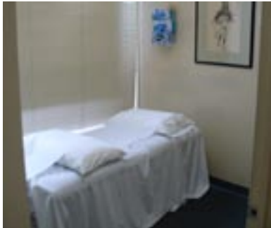
One of our Exam Rooms

VOLUNTEER at Mercy & Wisdom! We need support staff, clinicians and help with fundraising and special events.