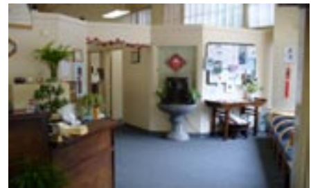
Our clinic's reception and waiting room

As the need grew, so did Mercy and Wisdom. In January of 2008, we opened our doors five days a week. Every week 20 volunteer practitioners and 15 staff volunteers take care of an average of 60 patients. Soon Dental and Vision Care will also be available.