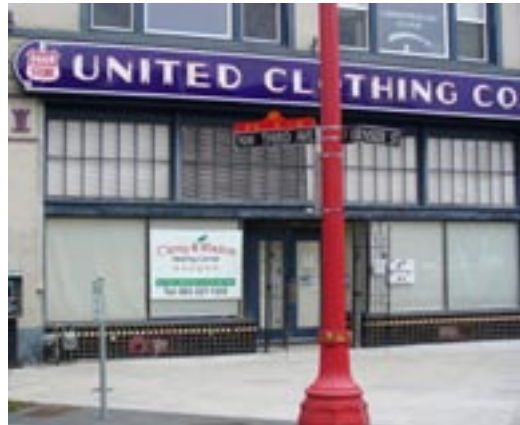
Our present location at 3rd and W Burnside in the historic United Clothing Building

Mercy & Wisdom Healing Center is a non-profit 501 (c) (3) community clinic. We are one of thirteen members of the Coalition of Community Health Clinics serving the health care needs of Portland and a member of the Portland Alliance.